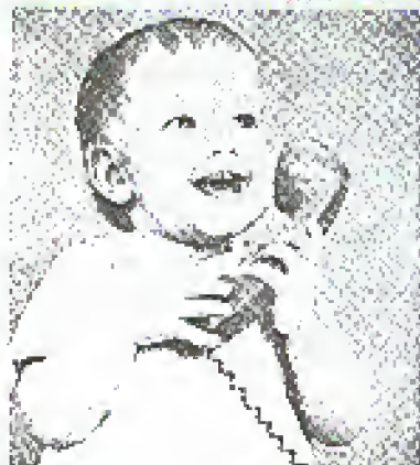
"Wow, another bank machine!"

We will be keeping track of what has already been mapped out. Remember, this activity is FREE and LEGAL!!